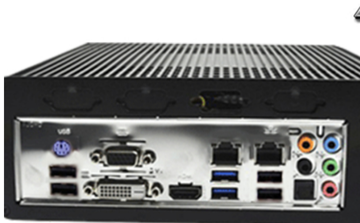
3x Industrial MiniPC mBOX-4130 2LAN v.1