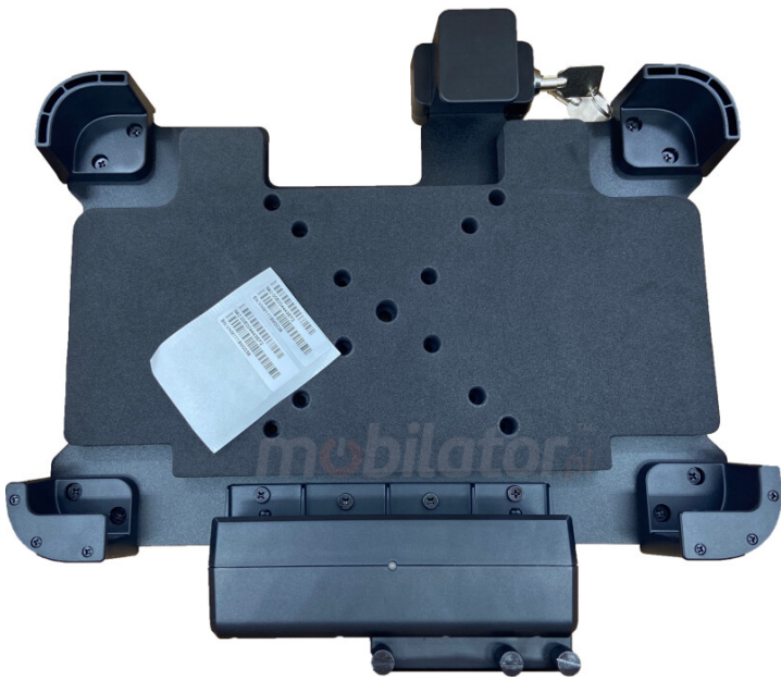
Car holder long EM-VHM11H - Emdoor Q11 and I11H

Category: Accessories - mobile Manufacturer: EMDOOR