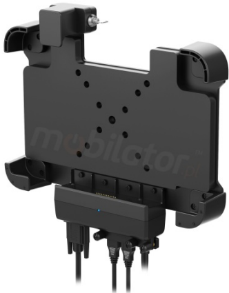
Car holder short EM-VHM16H - Emdoor Q16 and I16K

Category: Accessories - mobile Manufacturer: EMDOOR