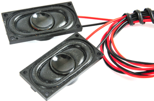
DNSYS - 2 x Speakers

Category: Accessories - mobile Manufacturer: DNSYS