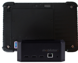
Windows 10 Pro with Bing*