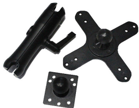
Car holder (long)