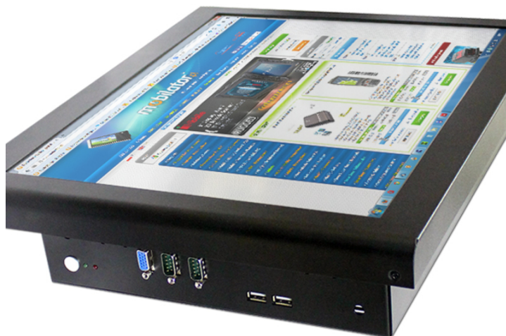
Industrial PanelPC D-SYS 17 v.3