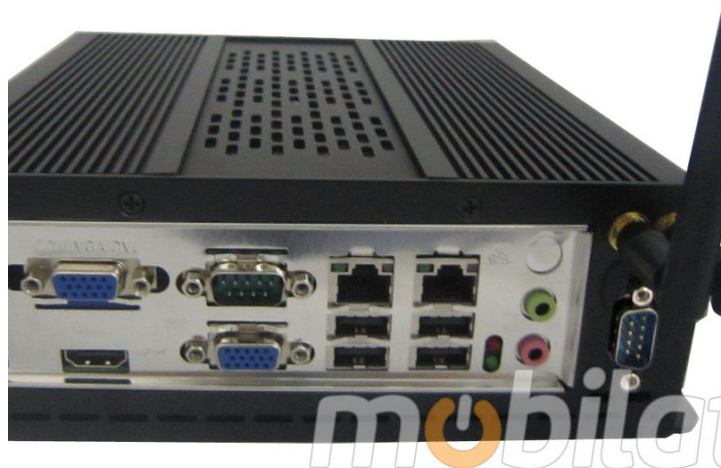
Industrial MiniPC IBOX-H5-S100 High (WiFi - Bluetooth)