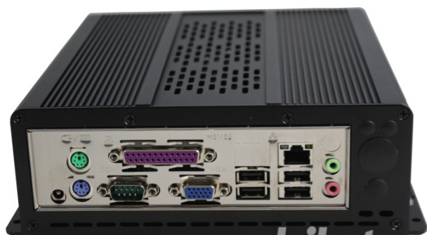
Industrial MiniPC IBOX-M847-S100