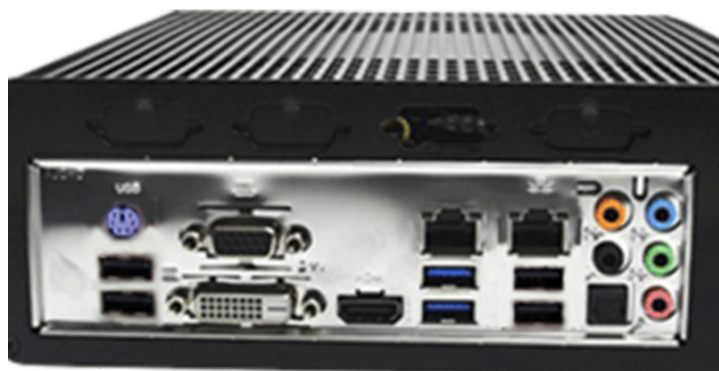
Industrial MiniPC mBOX-4130 2LAN v.3