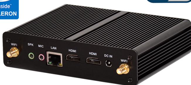
Industrial MiniPC mBOX-M195D v.2