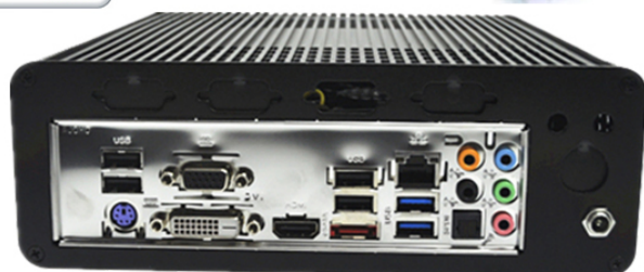
Industrial MiniPC mBOX-T1820 v.1