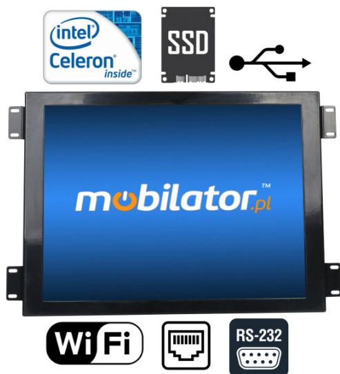
Industrial PC Panel with passive cooling IBOX IPC A-150 J1900 v.2