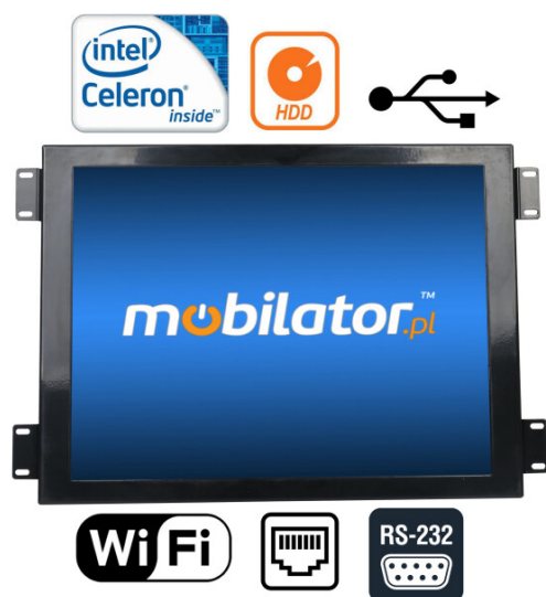
Industrial PC Panel with passive cooling IBOX IPC A-150 J1900 v.3