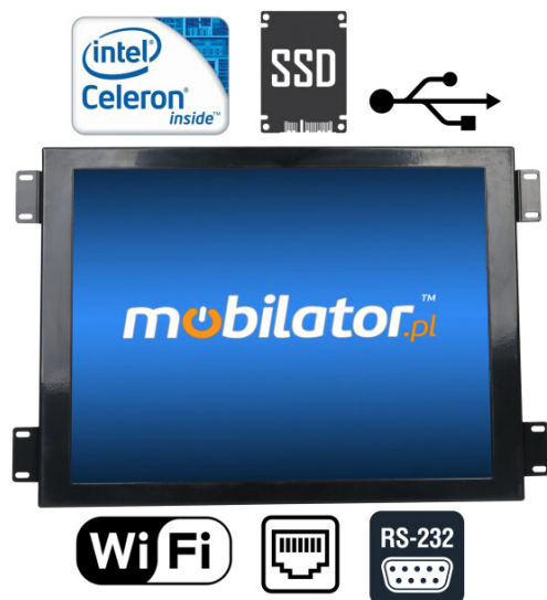
Industrial PC Panel with passive cooling IBOX IPC A-150 J1900 v.4