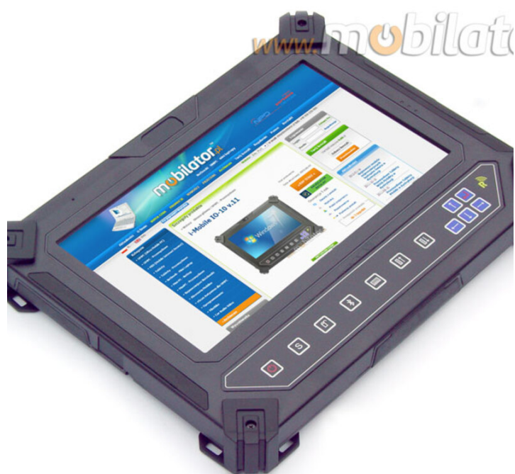
Industrial Tablet i-Mobile IO-10 v.3