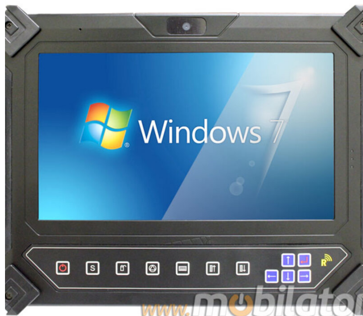
Industrial Tablet i-Mobile IO-10 v.4