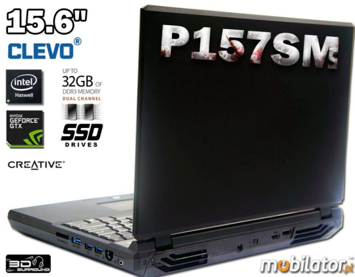
Laptop - Clevo P157SM v.0.0.2 - Barebone