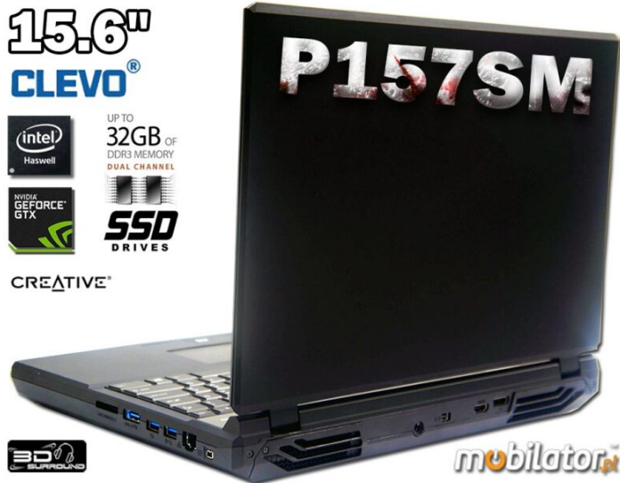
Laptop - Clevo P157SM v.8