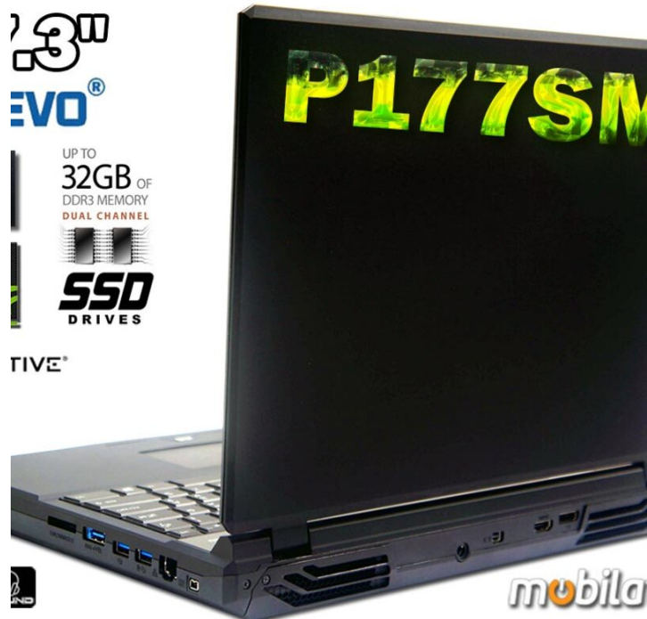
Laptop - Clevo P177SM v.0.1a