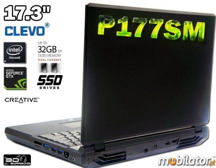
Laptop - Clevo P177SM v.7