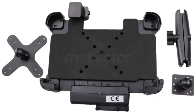
Lockable long car holder for tablets I16H / T16

Category: Accessories - mobile Manufacturer: EMDOOR