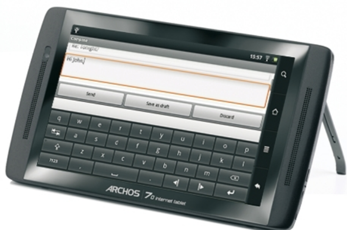
MID - Archos 70 (8GB)