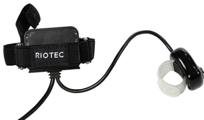
Mini scanner 1D Riotec DC-9267A MicroUSB