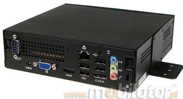
MiniPC Industrial AOpen DE7000 v.2