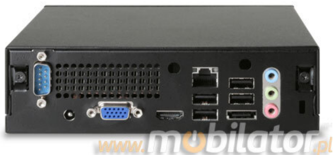
MiniPC Industrial AOpen DE7000 v.3