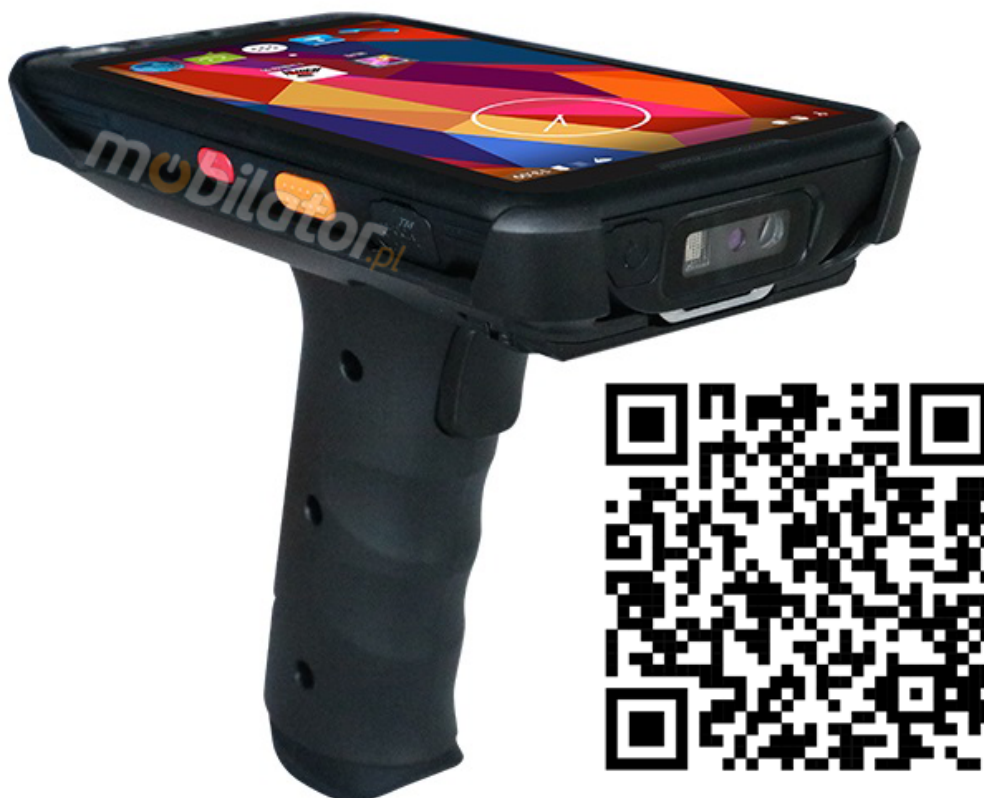
Zebra SE4710 2D barcode scanner

quickly and accurately retrieves the data, which helps to increase the rate and efficiency. You can jump-start a whole because with simplified installation procedure and intuitive, comfortable design to prepare the scanner to work is very easy.