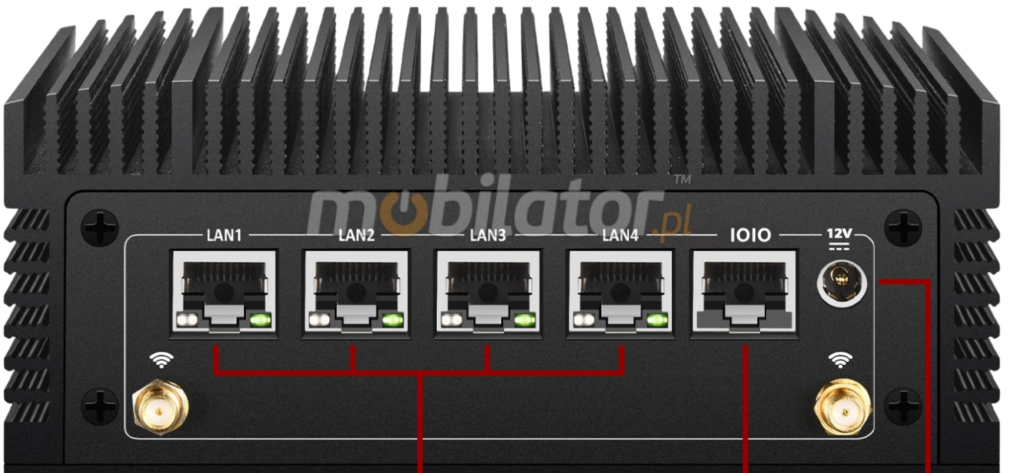
4x 2.5G LAN IOIO DC IN COM connector (via RJ45 cable)