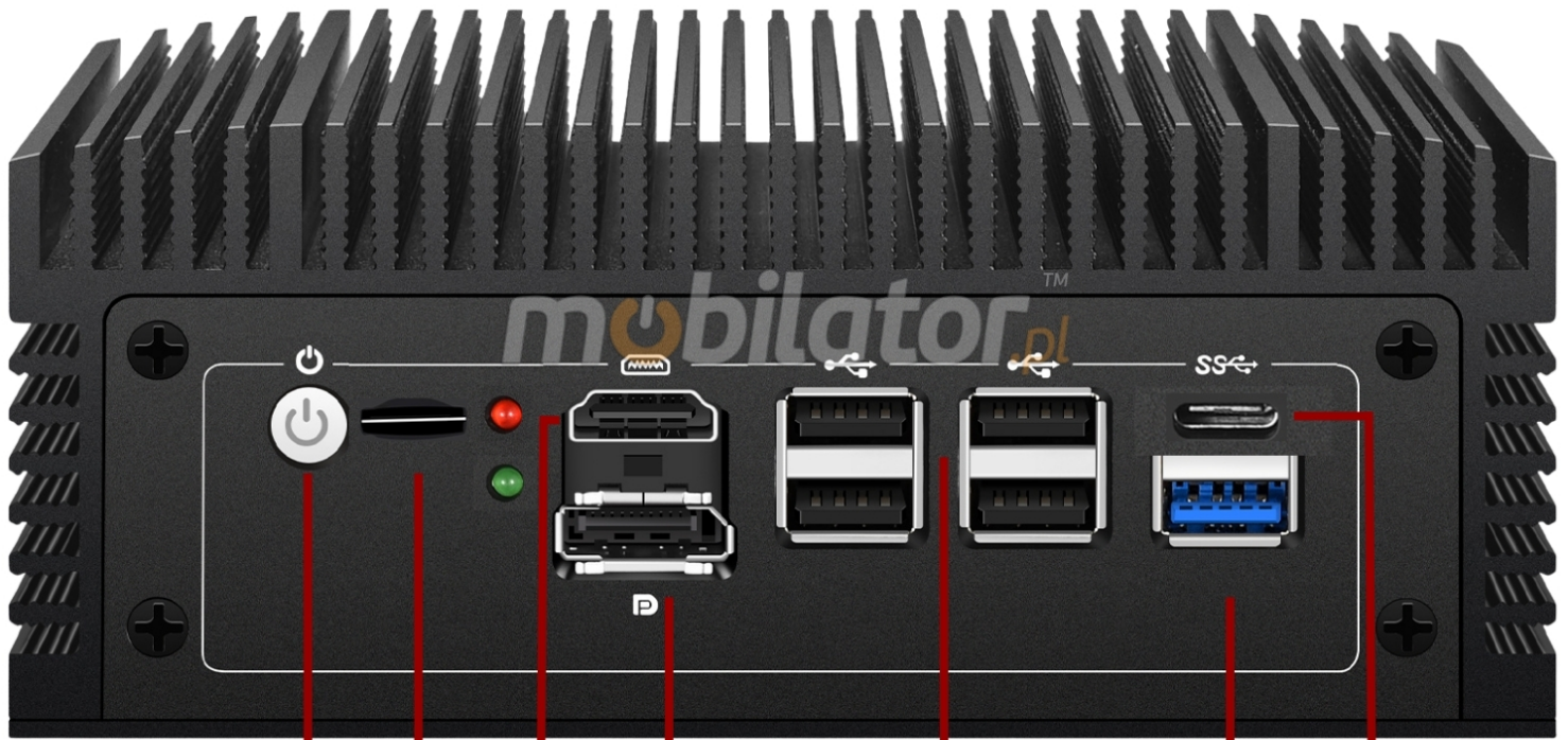
Power button Slot SIM HDMI 2.0b DisplayPort 4x USB 2.0 USB-C 3.0 USB 3.0