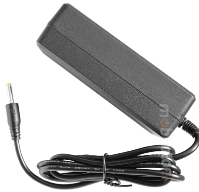
Standard adapter for industrial tablet