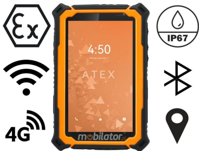
MobiPad Tex17 v.2 - IP67 and ATEX Zone 1 Tablet with HF RFID Reader 7