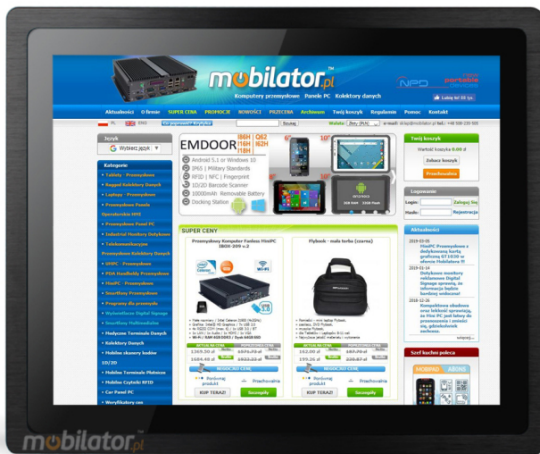
MoTouch 10.4 - Industrial Monitor with IP65 on front cover