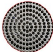
Outlet & Inlet for A/C