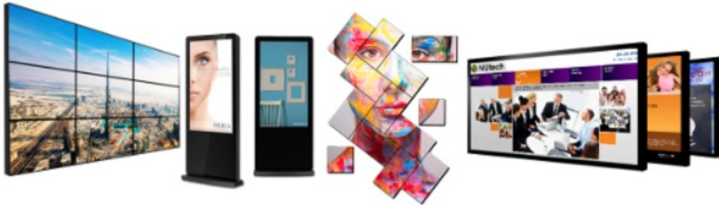
4K screen (Optional)

also affects the consumption of electricity, because the sensor regulates the screen backlight, reducing the amount of electricity consumption. The selection of the appropriate brightness of the screen at night does not blind, for example- road users, if the totem is placed near it.