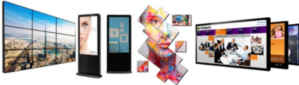
4K screen (Optional)

also affects the consumption of electricity, because the sensor regulates the screen backlight, reducing the amount of electricity consumption. The selection of the appropriate brightness of the screen at night does not blind, for example- road users, if the totem is placed near it.