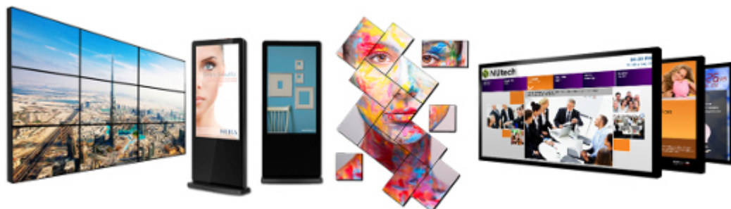
4K screen (Optional)

also affects the consumption of electricity, because the sensor regulates the screen backlight, reducing the amount of electricity consumption. The selection of the appropriate brightness of the screen at night does not blind, for example- road users, if the totem is placed near it.