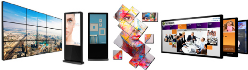
4K screen (Option)

also affects the consumption of electricity, because the sensor regulates the screen backlight, reducing the amount of electricity consumption. The selection of the appropriate brightness of the screen at night does not blind, for example- road users, if the totem is placed near it.