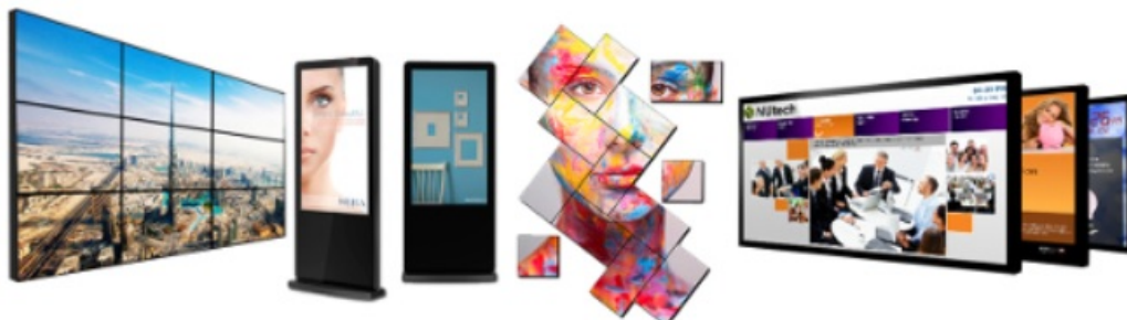
4K screen (Optional)

also affects the consumption of electricity, because the sensor regulates the screen backlight, reducing the amount of electricity consumption. The selection of the appropriate brightness of the screen at night does not blind, for example- road users, if the totem is placed near it.