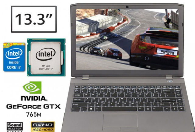
Notebook - Clevo W230ST v.0.3