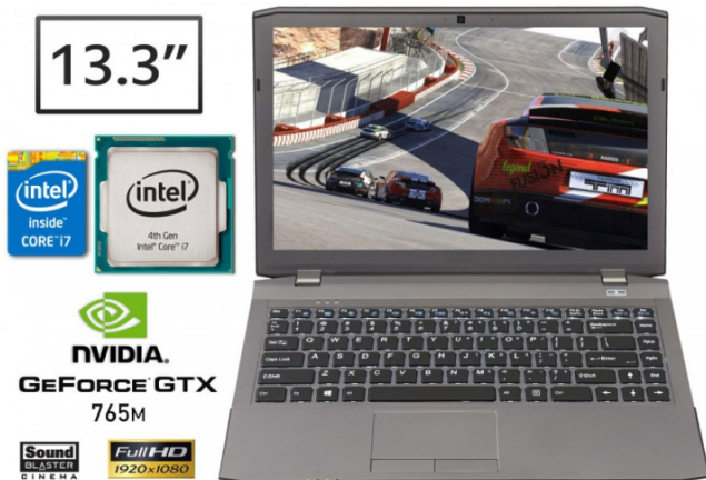
Notebook - Clevo W230ST v.7