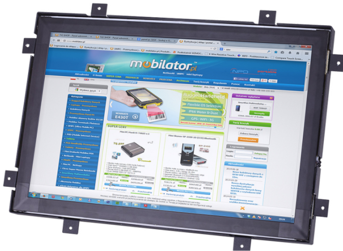
Open Frame Touch Screen PC CCETouch CT19-OPC-SAW