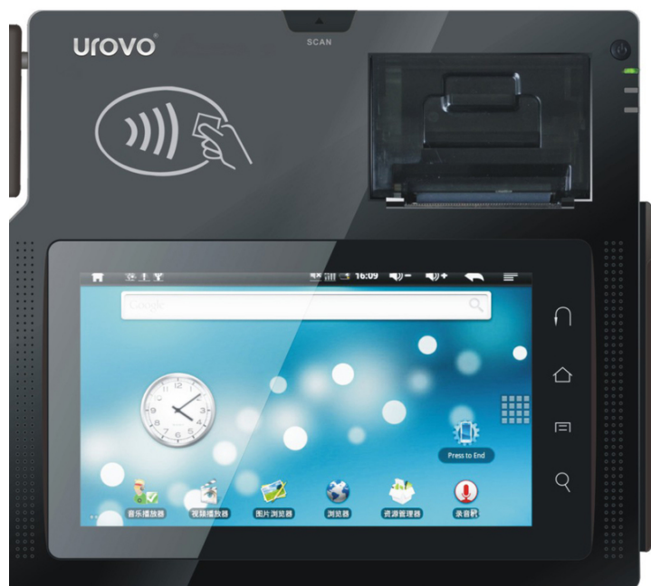
Payment terminal UROVO i9300 v.3