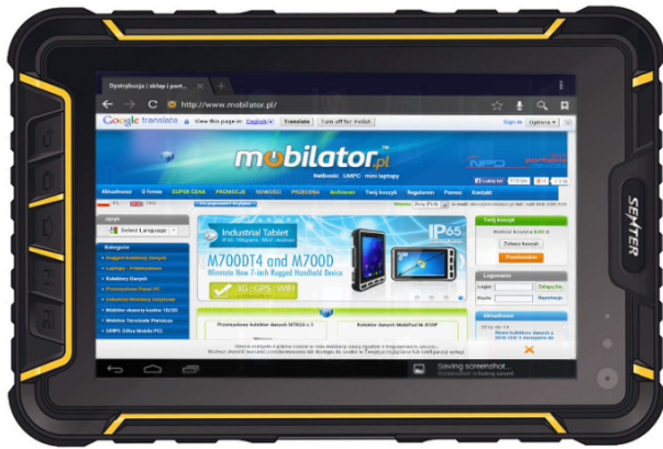
Rugged Senter ST907 v.13