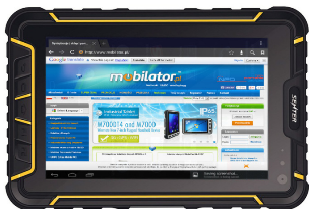
Rugged Senter ST907 v.4