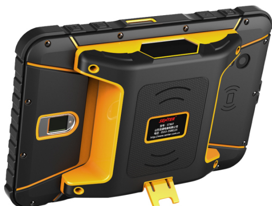
Rugged Senter ST907 v.8