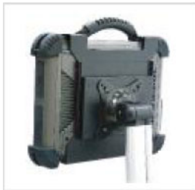
Vehicle Mount Kit VESA