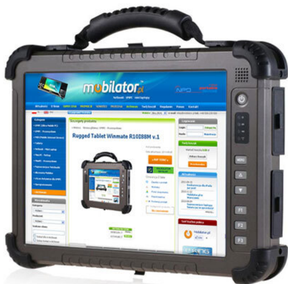
Rugged Tablet Winmate R12I88M v.4