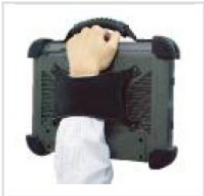
Vehicle Mount Kit