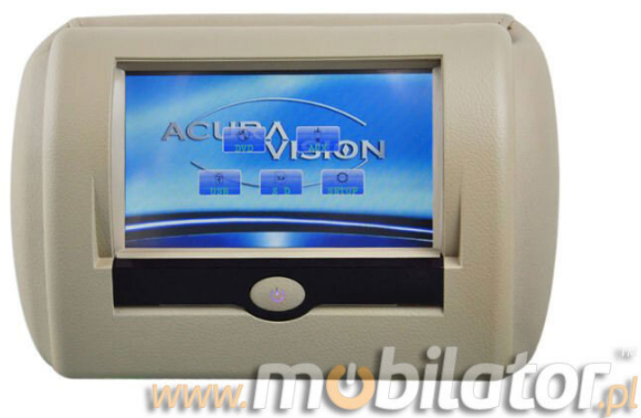
Touch Headrest Audio/Video - DVD