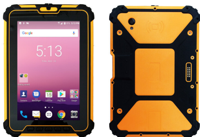
Waterproof rugged industrial tablet Senter ST927 NFC + GPS