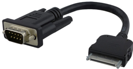
Winmate M101B - 30pin-RS232

Category: Accessories - mobile Manufacturer: Winmate