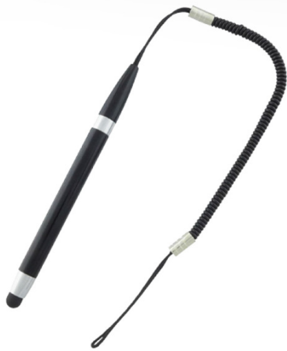
Winmate M101B - Capacitive Stylus

Category: Accessories - mobile Manufacturer: Winmate